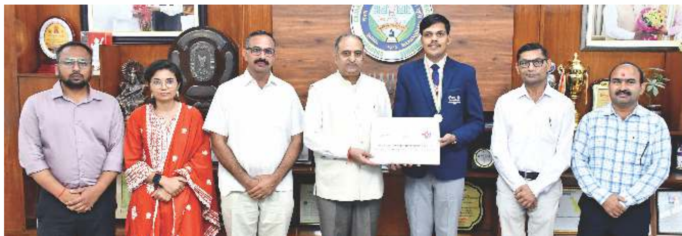
Hon'ble Vice-Chancellor felicitated NSS award winner under My Bharat Initiative, recognizing outstanding contributors presented by the Hon'ble President of India