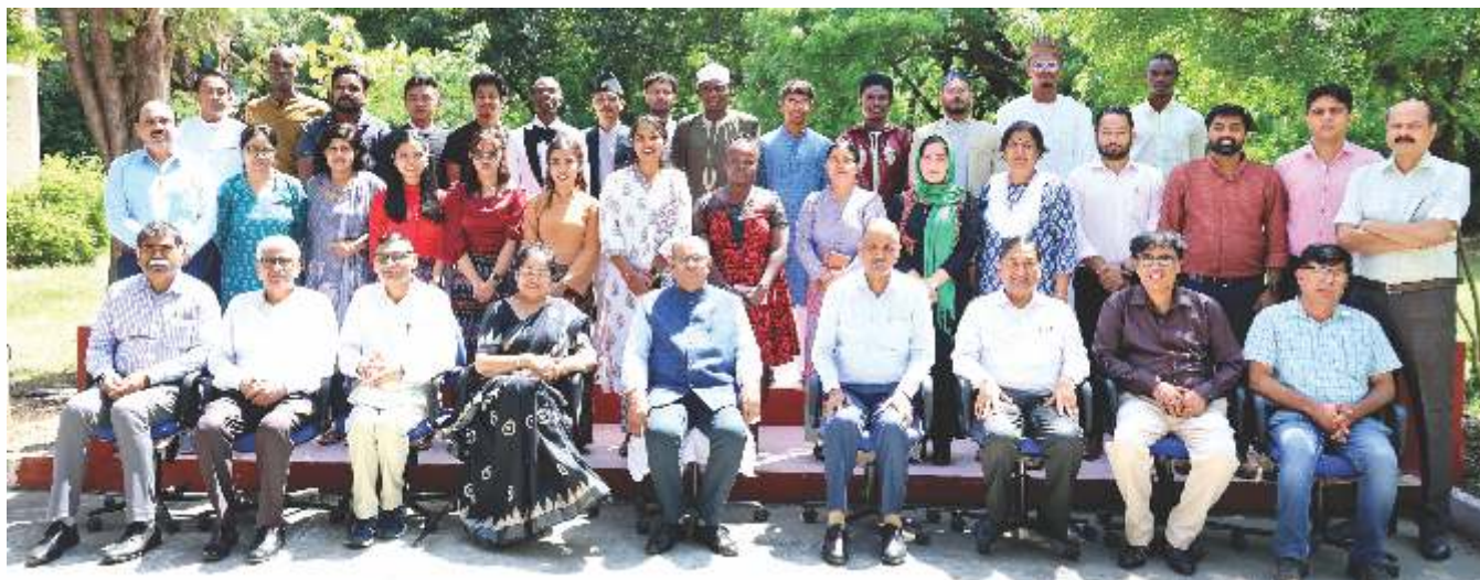
The Dean, Postgraduate Studies, hosted an engaging interaction session with international students, fostering cultural exchange and strengthening academic collaboration.