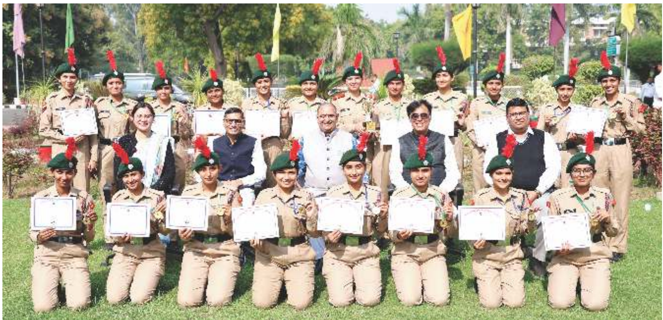
NCC cadets, winning Gold Medals and Certificates, participated in the NCC Camp were felicitated by the Hon'ble Vice-Chancellor

Director of Extension Education/Director of Research CCS Haryana Agricultural University, Hisar