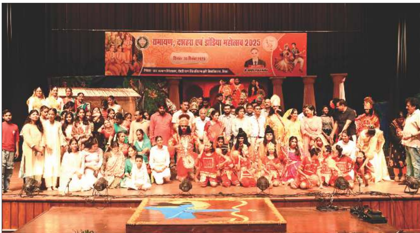
Ramayana, Dussehra & Dandiya Festival celebrated with fan and fervour.

The Prospectus gives only general information about the various Constituent Colleges and programmes offered. Detailed rules on all aspects are available in the University Calendar Vol. II and instructions issued from time to time.