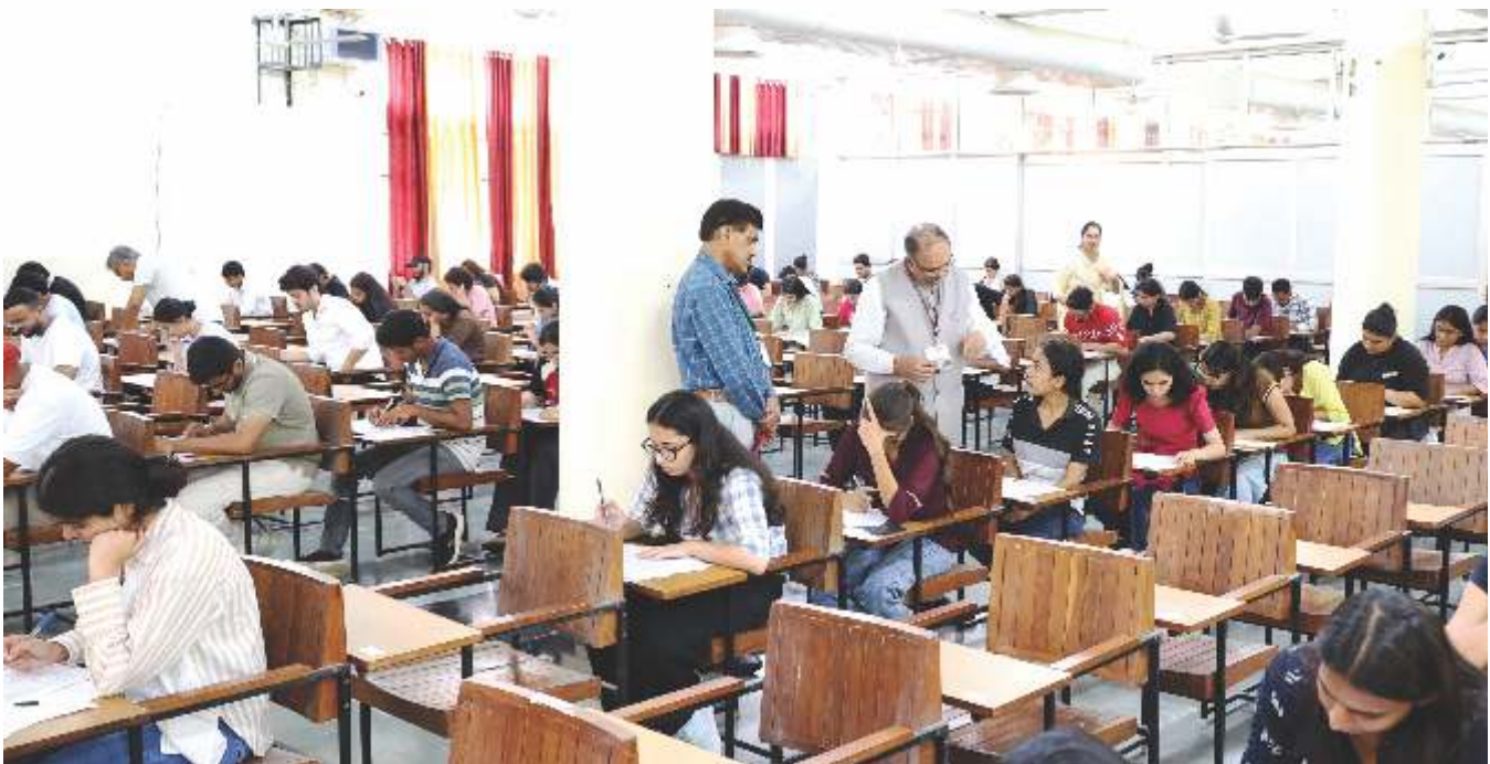
The Vice-Chancellor reviewed the university entrance examination process, ensuring transparency and smooth conduct.