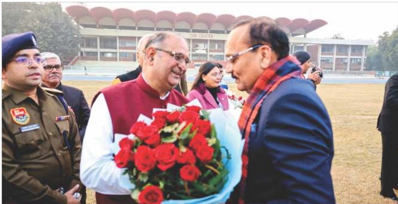
Hon'ble Chief Justice of India, Justice Suryakant, visited CCSHAU, Hisar, and was formally welcomed by the Vice-Chancellor.

Jurisdiction for all disputes shall be at Hisar.