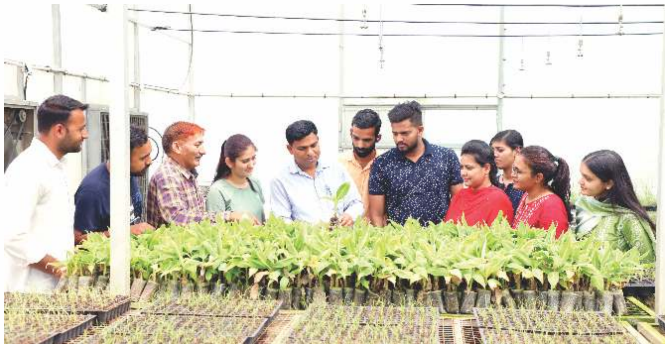
Students gained hands-on experience in tissue culture techniques, enhancing their practical agricultural skills.

* If the PWD candidates exceeds 3% then extra seats upto 2% more will be created.