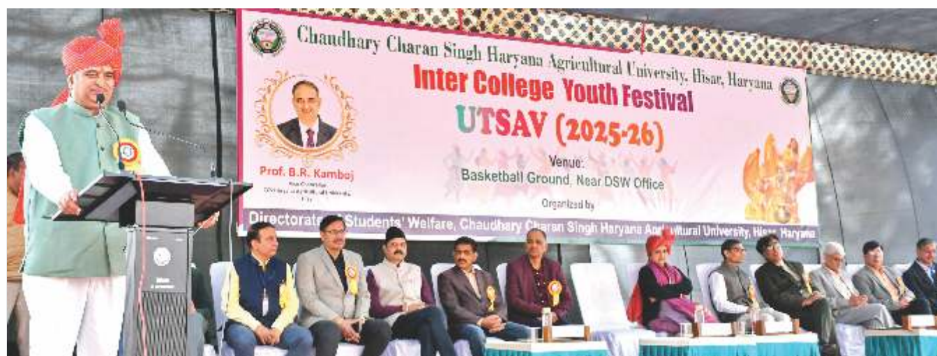
Inter-college Youth Festival showcasing talent, creativity, and cultural diversity among students.

This affidavit submitted by the candidate shall be as per the latest instructions of the time issued by the Government of Haryana.