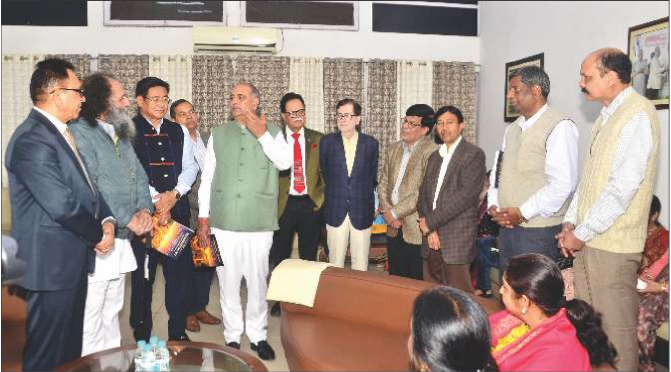
The Vice-Chancellor, CCSHAU, attended the Alumni Meet along with distinguished dignitaries from various countries, strengthening global academic relations.