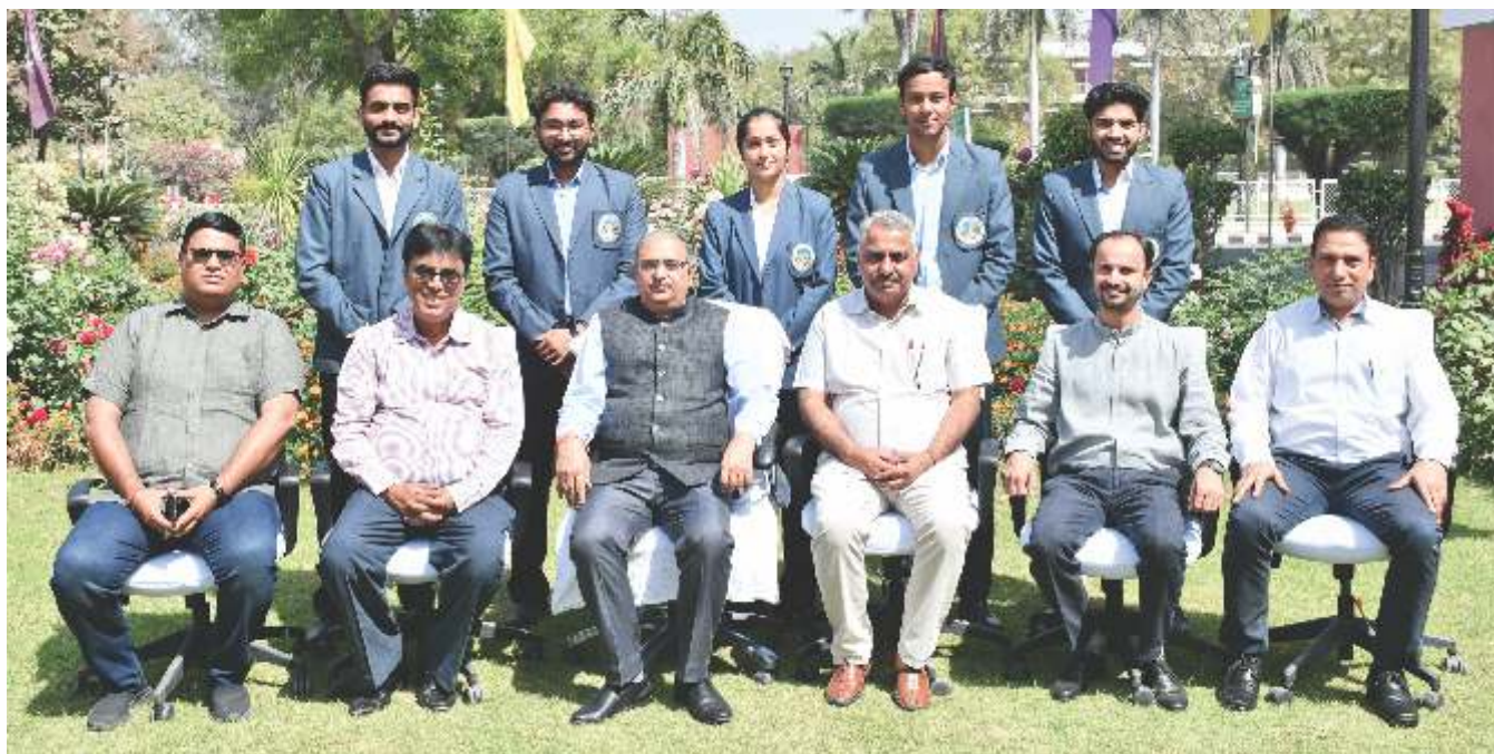
Group photograph of students selected during campus placement drives, marking a significant achievement.

This post graduate course shall not only provide job avenues for students but also open a field of viable and effective interaction with national establishment related to various aspects of remote sensing. The main objective of this course is to develop multidimensional teaching in the field of remote sensing and GIS application in agriculture and environmental management.