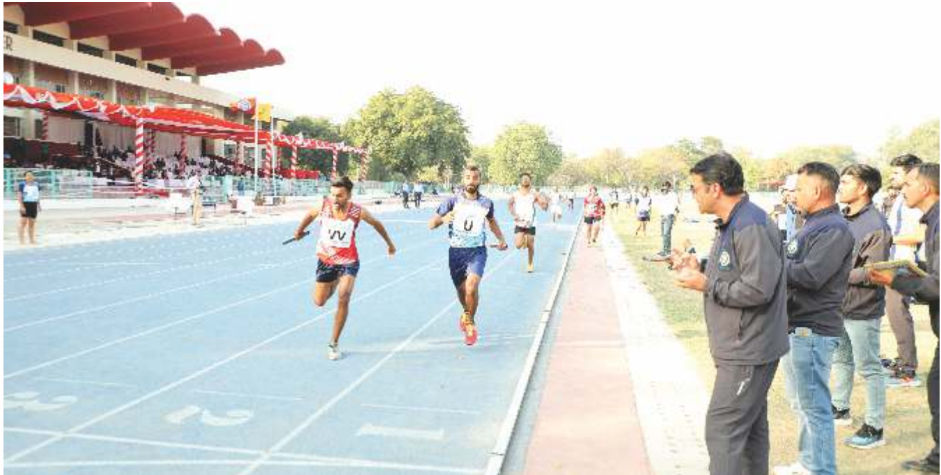
CCSHAU students showcased athletic spirit on the synthetic track at Giri Centre. The event drew cheers, reflecting skill and competitive zeal.