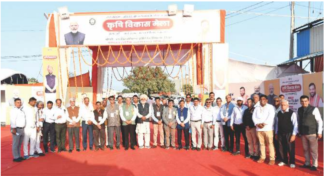
A group photograph captured during the Krishi Vikas Mela at Ladwa, Kurukshetra, reflecting vibrant farmer engagement and showcasing cutting-edge agricultural innovations.