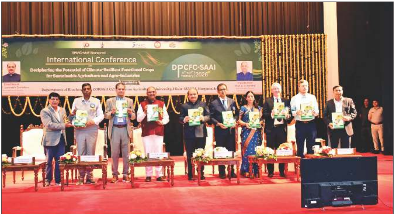
International Conference and Deciphering the Potential of Climate-Resilient Functional Crops for sustainable Agriculture and Agro-Industries (DPCFC-SAAI) organized in the University.