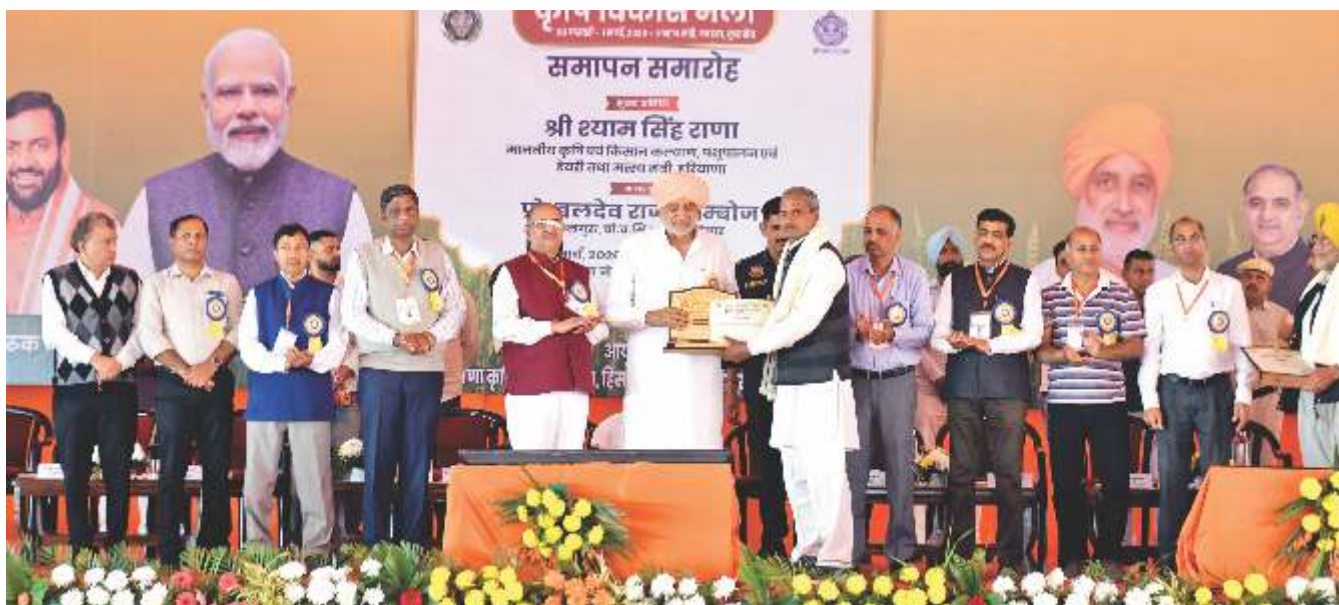
Honouring farmers at the valedictory ceremony of the Krishi Vikas Mela, celebrating agricultural excellence, with awards presented by the Hon'ble Agriculture Minister of Haryana.