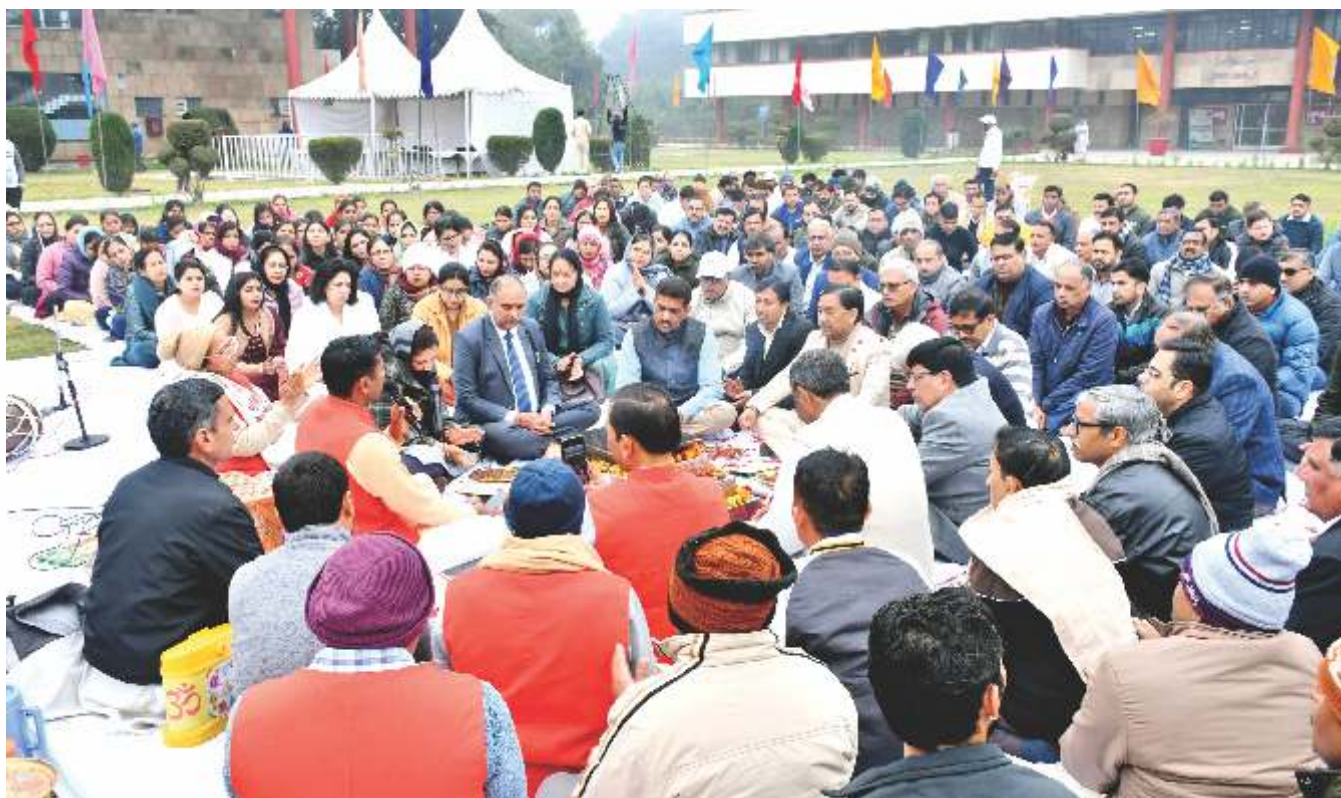
Foundation Day Hawan ceremony conducted in the presence of the Vice-Chancellor and university officials, reflecting tradition and institutional values.