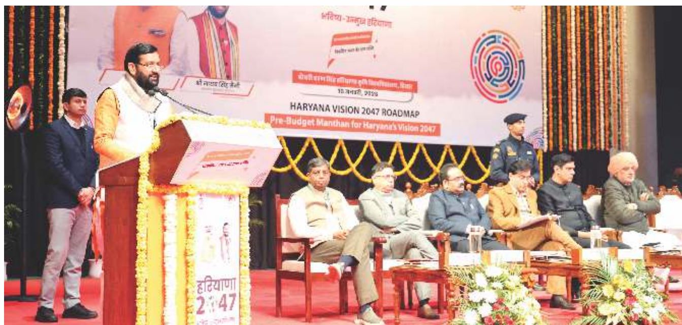
Addressed by the Chief-Minister on Haryana Vision 2047 during Pre-Budget Manthan, focusing on inclusive growth and future ready policies