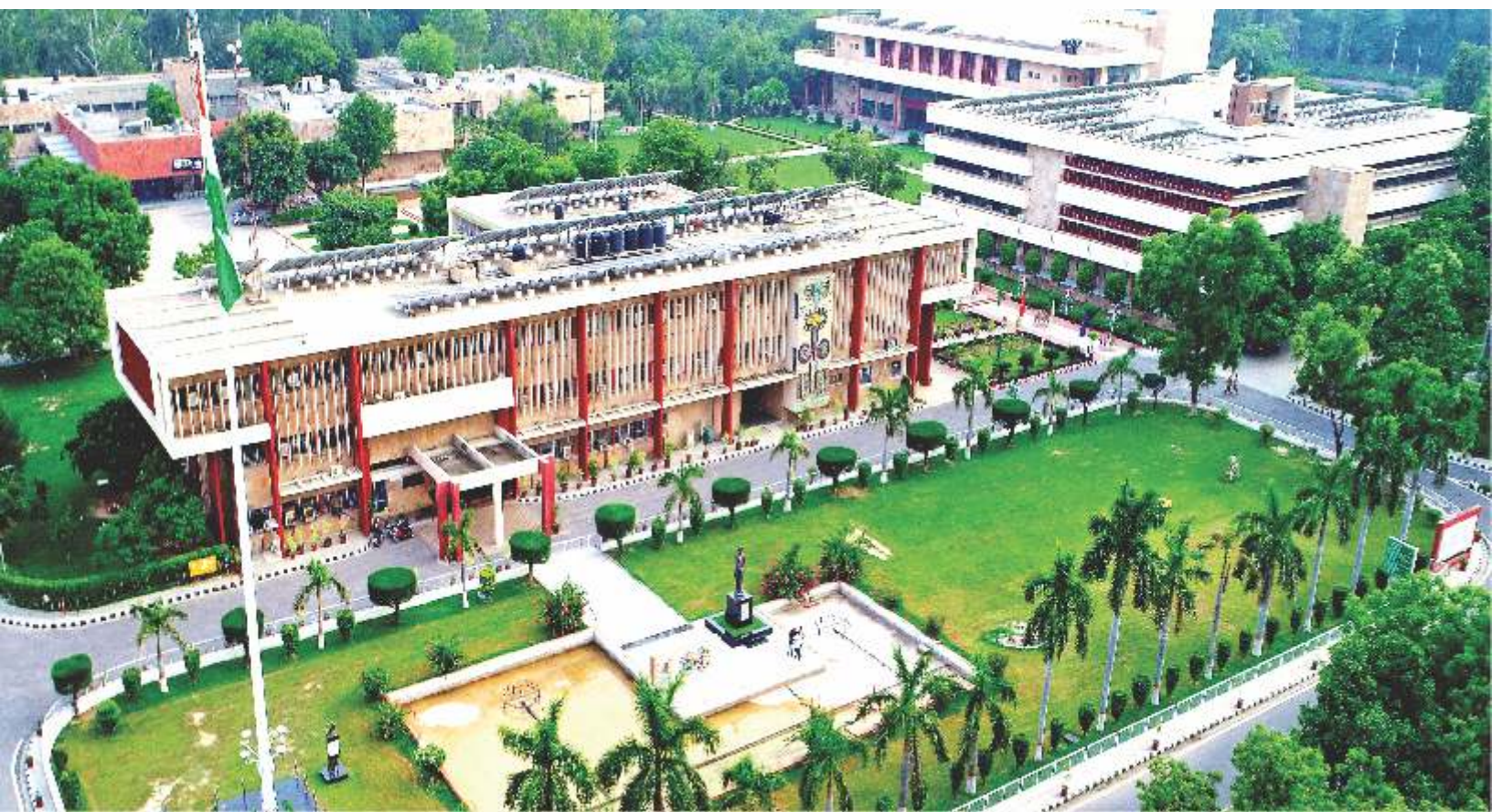
Aerial view of Fletcher Bhawan of CCSHAU Hisar

The main campus of the University is situated at Hisar at a distance of about 162 km North-West of Delhi of National Highway No. 9 and is 2.5 km from the Hisar Railway Station and 3 km from the Bus Stand. The University is spread over an area of 2922 hectares at Hisar and 645 hectares at outstations. Area under farms at Hisar is 2624 hectares and under buildings and roads is 298 hectares. Since its existence, the University has been making rapid progress in building construction and has an excellent infrastructure. The University has one of the best developed campuses in India and fulfils academic and extra-curricular needs of the students.