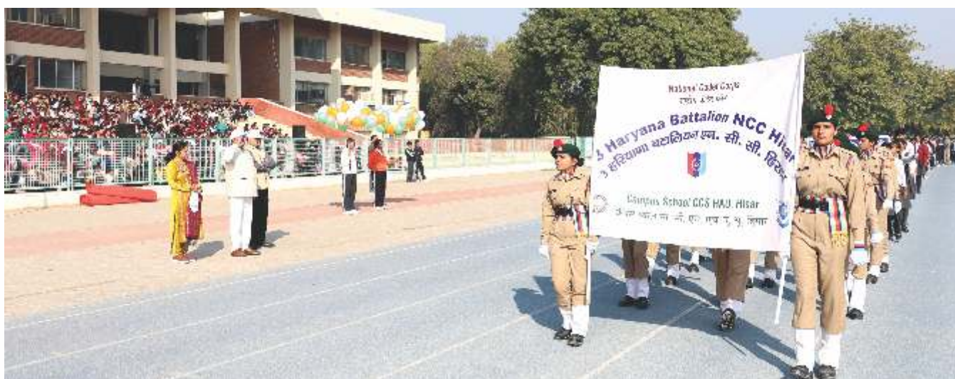
“Instilling discipline, leadership, and patriotism–NCC cadets of CCS Haryana Agricultural University march with pride and purpose.”