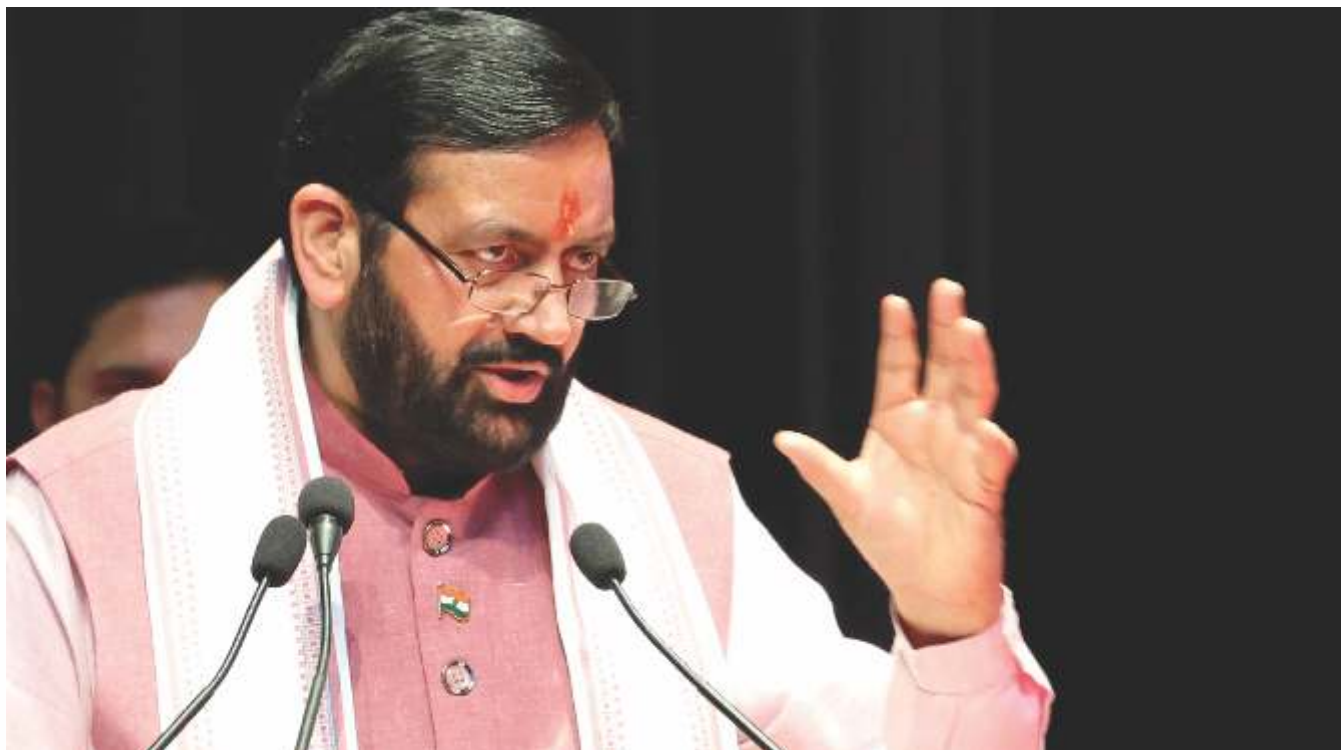
Hon'ble Chief Minister of Haryana addressed the gathering during Udyamita Diwas, highlighting development initiatives.”