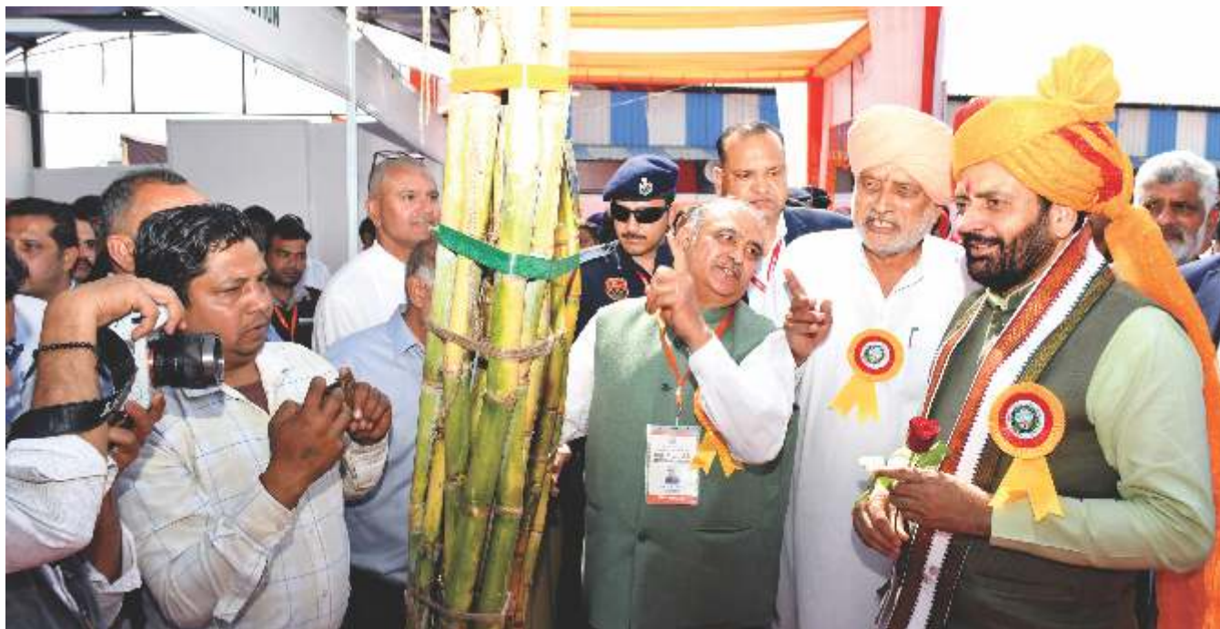
Hon'ble Chief Minister of Haryana visited Krishi Vikas Mela (Kharif), Ladwa, Kurukshetra; the Vice-Chancellor presented advancements in sugarcane cultivation.

Any provisions or guidelines provided in the Prospectus are not final and are subject to modifications made by the Competent Authority under the Act & Statutes and if superseded by such decision by the Competent Authority, the latter will prevail and the information given in the Prospectus shall stand modified to that extent automatically.