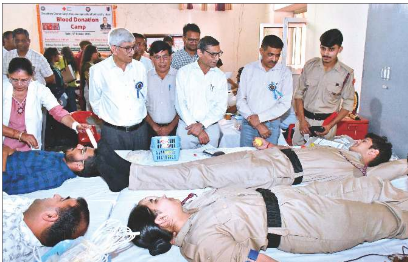
NCC students actively participated in a blood donation camp in the presence of the Registrar and other university officials.

The Prospectus gives only general information about the PGDC programmes offered by various constituent colleges with the major departments offering the programmes. Detailed rules on all aspects are available in the University Calendars and instructions issued from time to time.