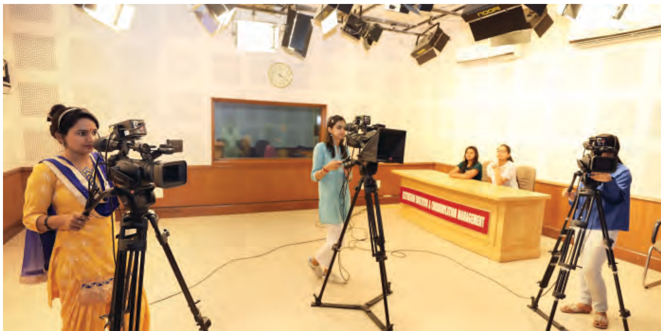
Full View and working of AV Lab of COHS