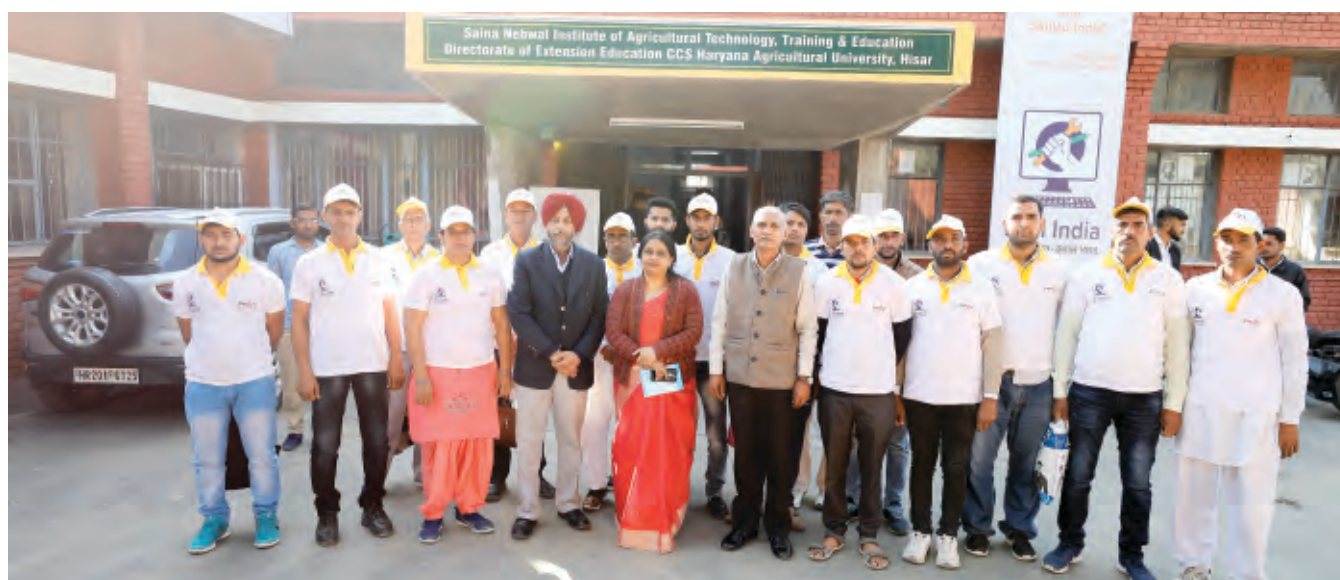
Skill Development Programme for Mushroom Growers Participants with Director, North Zone, ASCI of India and University Faculty

Rest of the points would belong to the general category.