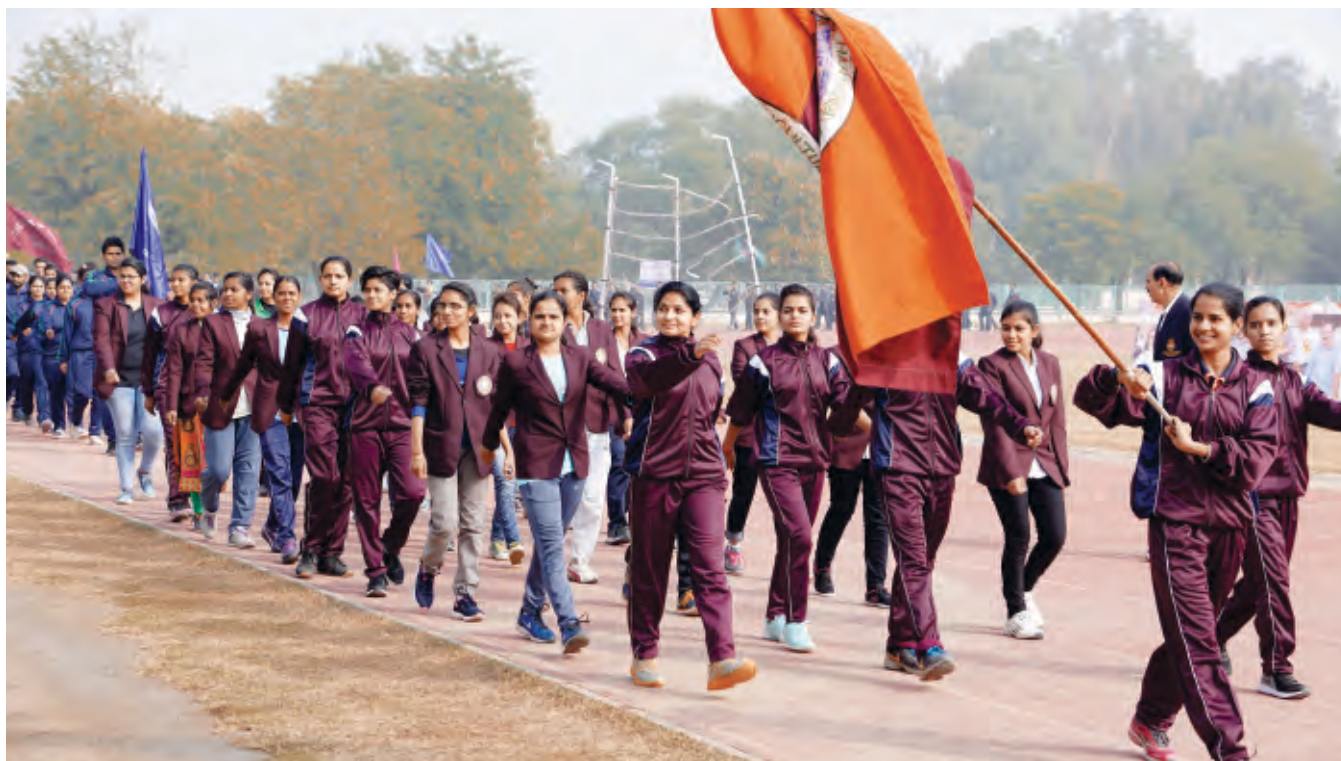
March-Past in the Athletic Meet