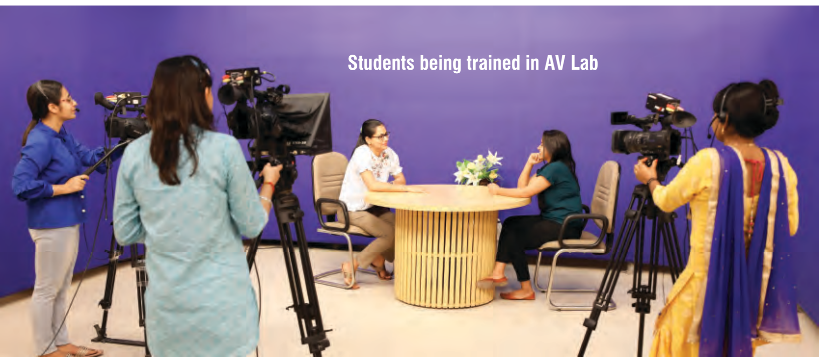
Students being trained in AV Lab