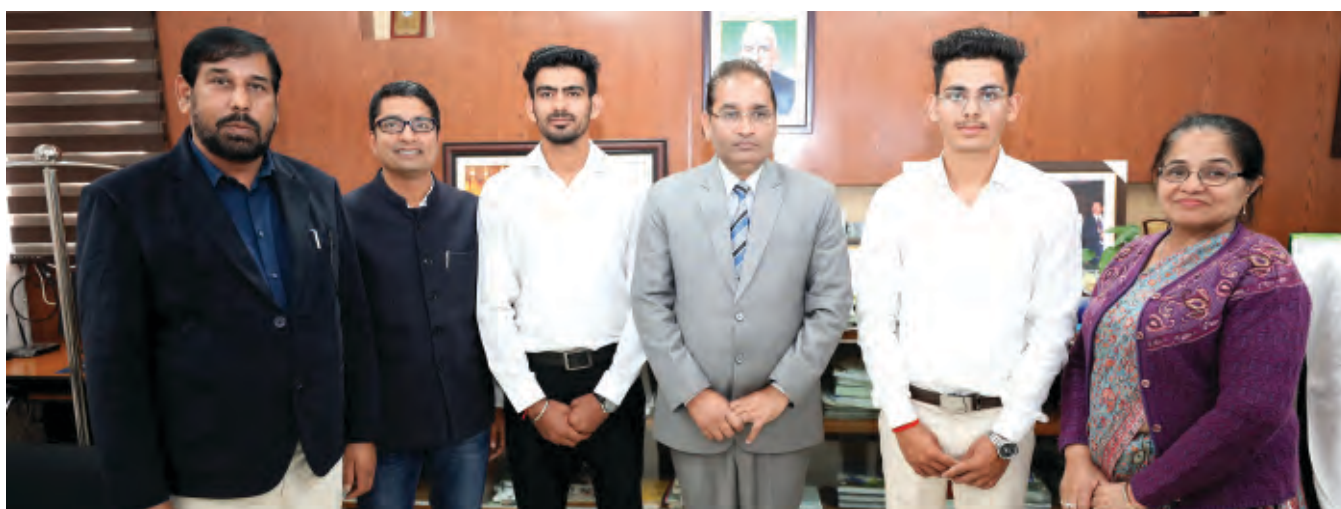
Full time scholarship awarded to two students from CCSHAU to visit Tokyo University of Agriculture