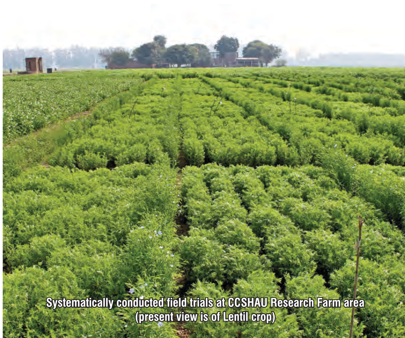
Systematically conducted field trials at CCSHAU Research Farm area (present view is of Lentil crop)

The main campus of the University is situated at Hisar at a distance of about 190 km North-West of Delhi on National Highway No. 9 and is 2.5 km from the Hisar Railway Station and 3 km from the Bus Stand. The University is spread over an area of 6095 acres at Hisar and 1418 acres at outstations. Area under farms at Hisar is 5359 acres and under buildings and roads is 736 acres. Since its existence, the University has been making rapid progress in building construction and has an excellent infrastructure. The University has one of the best developed campuses in India and fulfils academic and extra-curricular needs of the students.