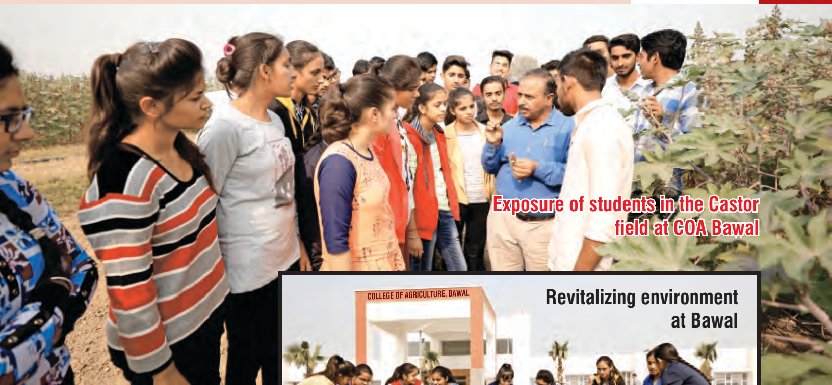
Exposure of students in the Castor field at COA Bawal