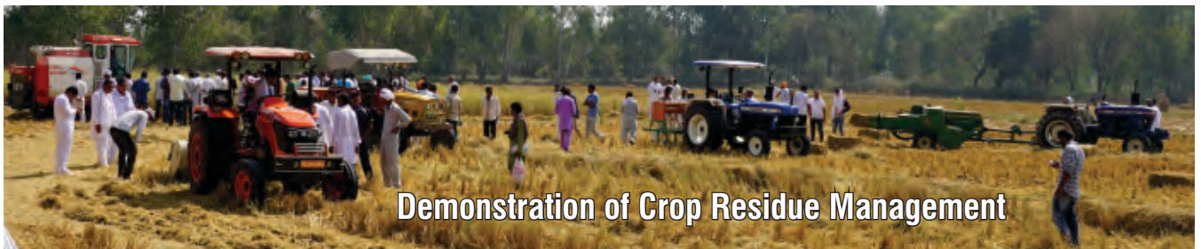
Demonstration of Crop Residue Management