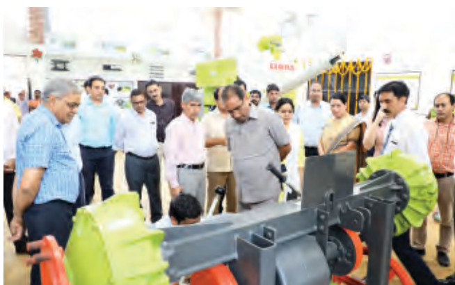
Officers of University visiting Combine Harvesting Technology Training Lab