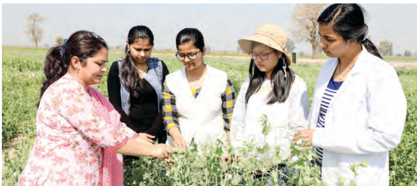
UG and PG students get exposure to work with different crops during Farm Practical classes