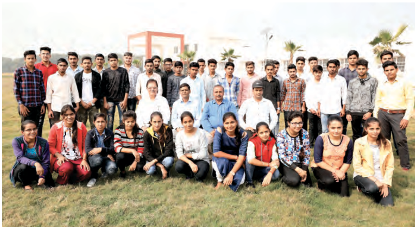
Students of COA Bawal with Principal and other faculty during a training programme

In the event of any inconsistency amongst the rules or in the event of any clarification with respect of the above rules the matter shall be decided in accordance with UGC Regulations on Curbing the Menace of Ragging in Higher Educational Institutions, 2009 and Directions of the Hon'ble Apex Court regarding Prevention of Ragging with the approval of the Vice-Chancellor.