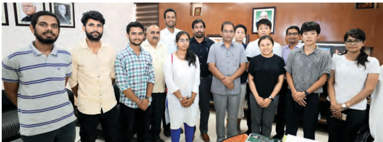
Visit of students and faculty of Tokyo University of Agriculture