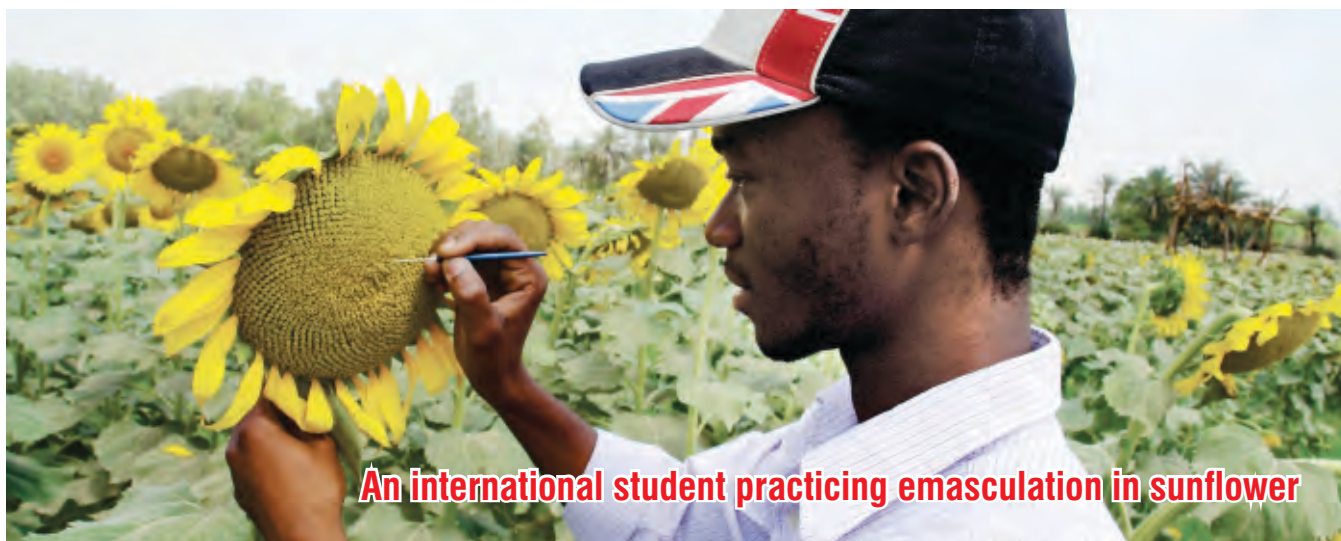
An international student practicing emasculating in sunflower