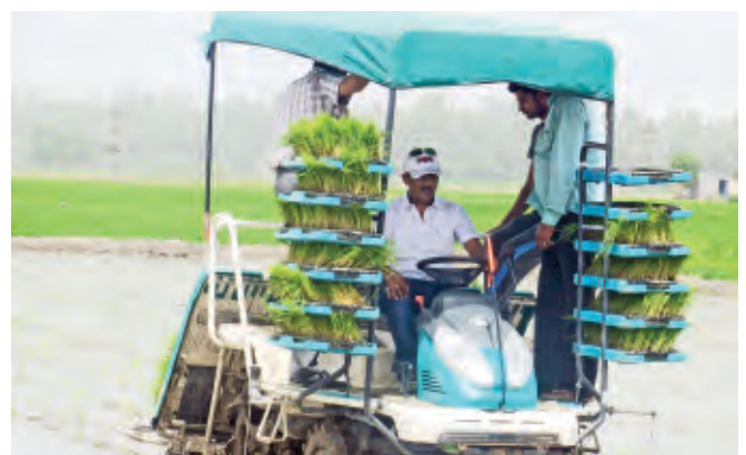
Self-propelled six row paddy transplanter being operated in the puddled field