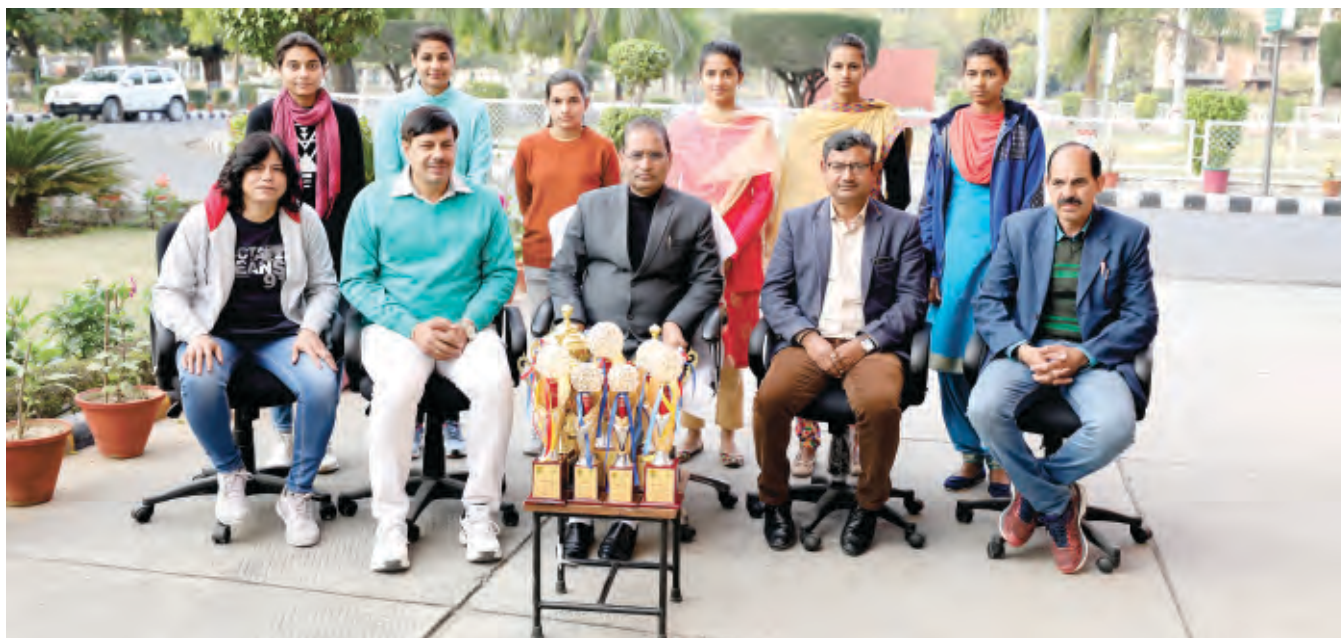
Award winners in Sports with Vice-Chancellor and other Officers

Director of Extension Education/Director of Research CCS Haryana Agricultural University, Hisar