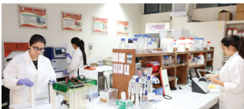
Students recording observations in the field (left) and working in the laboratory (right)