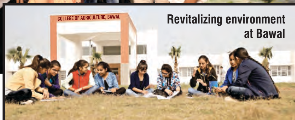
Revitalizing environment at Bawal