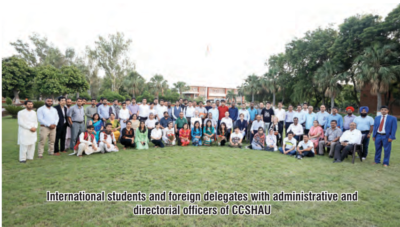
International students and foreign delegates with administrative and directorial officers of CCSHAU

Jurisdiction for all disputes shall be at Hisar.