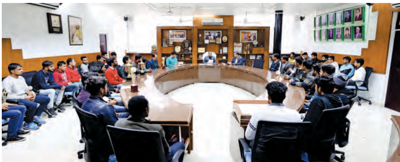
Award winning teams with Vice Chancellor, DSW and other Officials