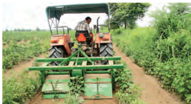
Tractor operated two row weeder being used in cotton field